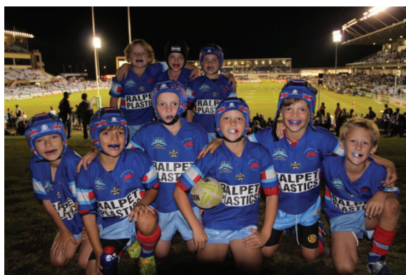
Our 8A's after their exhibition game at Shark Park

In 1997 & 1998 there was an additional A Reserves competition, A Reserves (2).